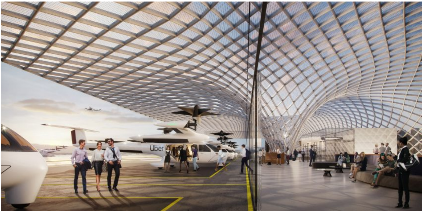
Foster + Partners' skyport proposal for Santa Clara is topped with a undulating roof

Uber Elevate says the conceptual scheme showcases "what aerial ride-sharing hubs could look like in the future in the Bay Area".