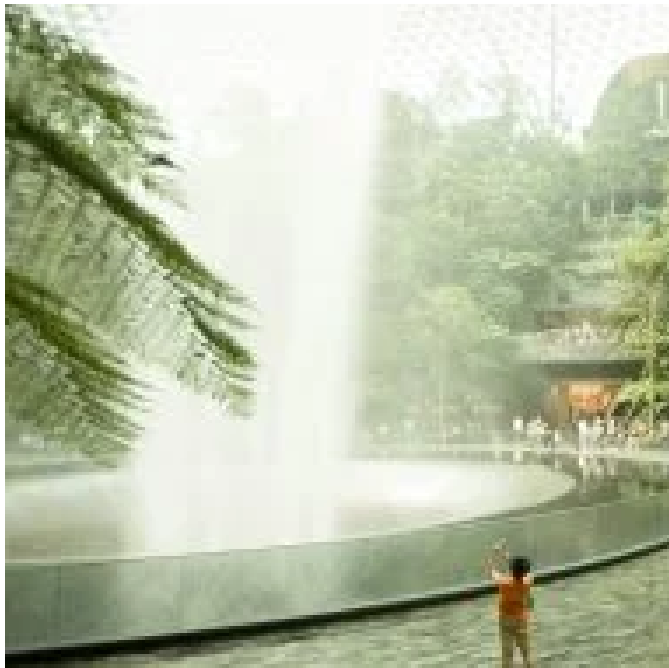
Video offers glimpse inside Safdie Architects' Jewel Changi Airport