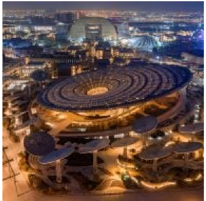
Dubai Expo reveals main pavilions ahead of rescheduled event