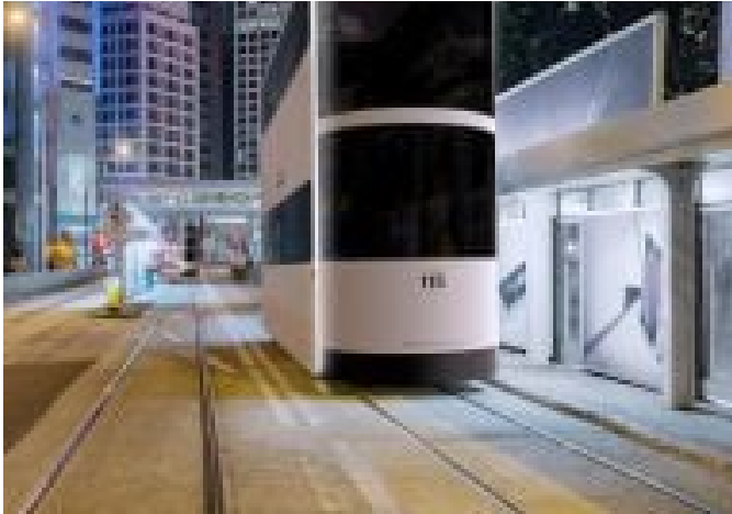
Ponti Design Studio creates driverless tram concept for Hong Kong post-Covid