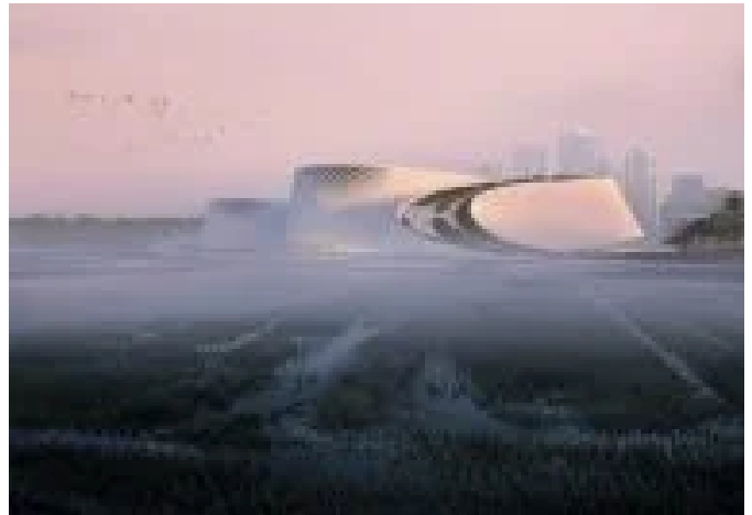
Shenzhen Natural History Museum has meandering path that mimics flow of rivers