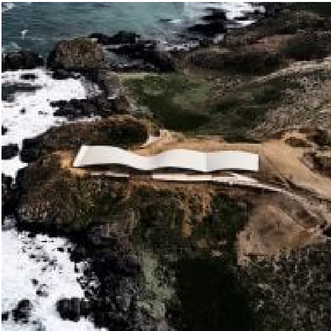
Wavy concrete roof covers weekend retreat in Chile by Ryue Nishizawa