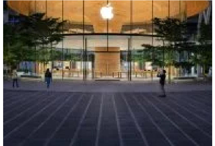
Tree-like column is centrepiece of Apple Central World by Foster + Partners