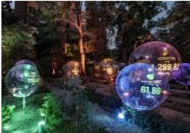
Carlo Ratti Associati partners with oil company for Milan design week