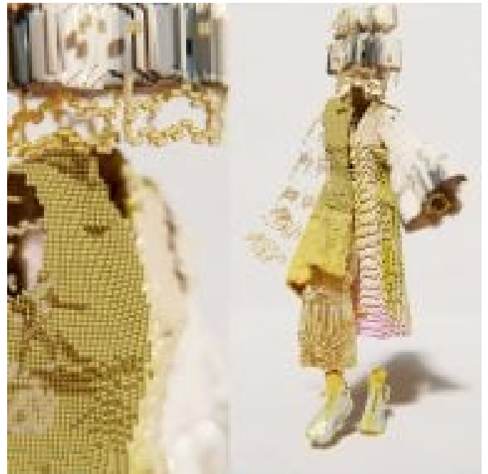
Santa Kupča creates pixelated digital clothing line Decrypted Garments